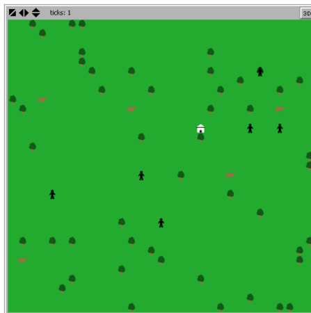
Fig. 3. A sample simulated environment using NetLogo.

We use NetLogo to implement and evaluate our ideas before detailed implementation. Its simplicity lets us to test our strategies in a multi-agent environment quickly. Furthermore, while contest server was not available NetLogo was utilized as an appropriate simulation environment. Figure 3 shows a sample simulated environment using NetLogo.